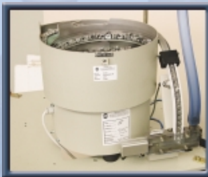
THE HOPPER HAS A CAPACITY OF 3,5 LITRES. NUT MOVEMENT BY VIBRATION.

MANUFACTURERS & SUPPLIERS OF RESISTANCE WELDING PRODUCTS